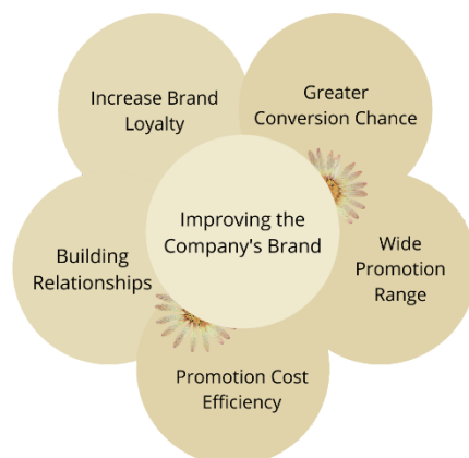
Figure 3. Form of Ponts

In the six promotional benefits taken by the author, Aik Cheong Indonesia has received similar promotional benefits through Instagram. The author has observed the data, so the author gets a lot of information, which will be explained in the form of points as follows: